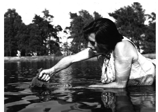
Fabrizio Plessi, Segare il Lago Stichter , 1975

UTOPIA LIQUIDA – The exhibition Utopia Liquida , with selected photographs from the 1970s, gives insight into Plessi's early creative phase in which he already began to develop water as the main theme of his art. In numerous interventions, that at the time were cutting edge happenings and conceptual art, his fascination for the ancient element became a source of inspiration. It originated from the omnipresence of the water in his chosen home Venice. The photographs show document and reflect his artistic happenings; some of them were already shown at the Venice Biennale in 1978. These include Plessi cutting apart running water in a sink into a hundred equal parts with a pair of scissors ( 100 Pezzi D'Acqua , Azione 1973), in Paris he tried to put a hole in the Seine River ( Un Buco Nell'Acqua , Azione 1973) and when he sawed the Stichter Lake by Neuenkirchen into equal halves ( Segare il Lago Stichter in due parti uguali , Azione 1975). In these absurd actions water is treated less like a natural element and more like a full-fledged aspect design element for the implementation of his imaginative ideas.