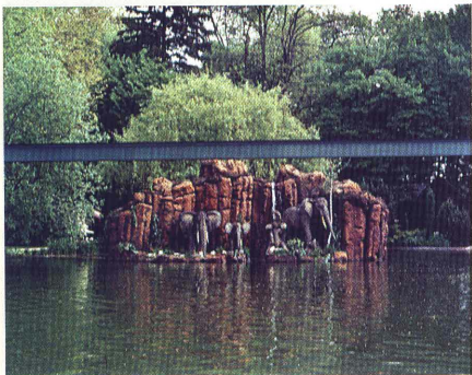
Magic Worlds, 1998